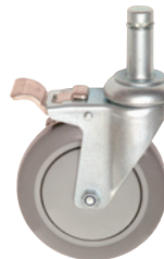
POLYURETHANE SWIVEL WITH BRAKE