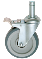
RUBBER SWIVEL WITH BRAKE