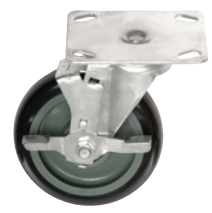
POLYURETHANE SWIVEL WITH BRAKE